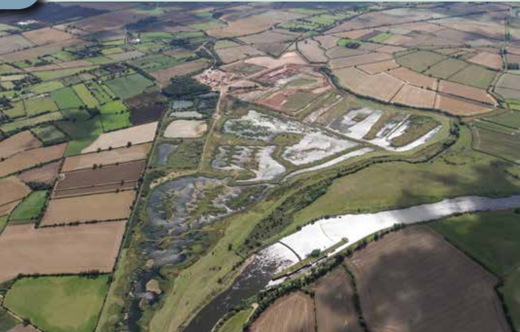
An aerial view of Langford Lowfields quarry and reserve demonstrates the wetland potential

The 'Bigger & Better' initiative covers the whole of the Trent and Tame valleys. Its 2050 vision is to bring it back as one of Britain's greatest wetlands – an "attractive, multi-functional and inspiring landscape loved and valued by all".