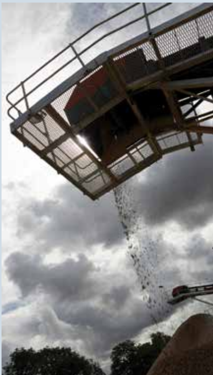
A storm is brewing over the 'withering' planning system

MPA has urged the Government to 'wake up' and make the link between its own ambitions for more homes and better infrastructure and the mineral products that make them possible.