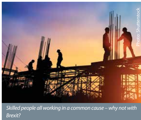
Skilled people all working in a common cause – why not with Brexit?

Business and industry are doing this all the time. We know what works and what does not. We are not theoreticians but pragmatists. We have to deliver to survive and work hard at developing the capabilities and capacity to ensure good outcomes in challenging conditions.