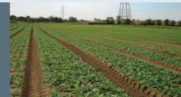
Laleham Farm: exotic vegetables

"The site looks good - you would never know that there used to be a quarry here."