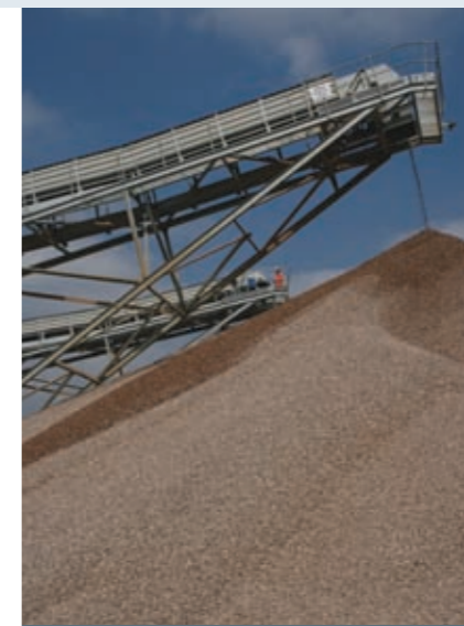
Responsible sourcing in Staffordshire

Responsible sourcing is a major issue for MPA, which has launched its own guidance for members. The aim is to ensure that specifiers' needs are met and that the industry contributes to Government targets.