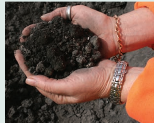
Alternative fuel: pelletised sewage sludge

from landfill. In that case, the wastes include pulverised fuel ash from power stations, crushed concrete, plasterboard and moulds