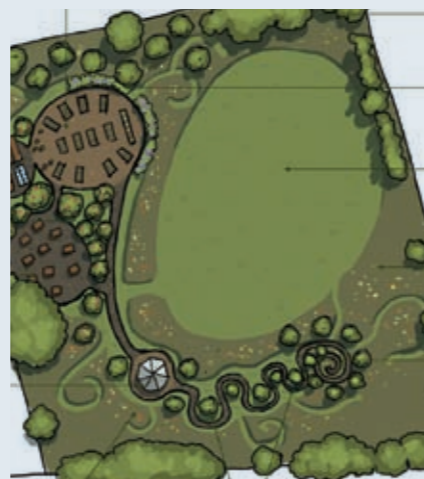
Eco garden in Lanarkshire

They are even building a greenhouse made out of recycled plastic bottles!