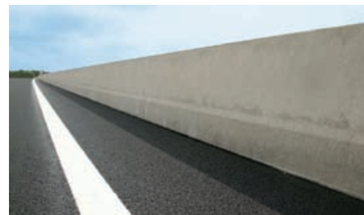
Concrete barriers – saving lives and reducing congestion

Health and safety is an important element of sustainability, and nowhere is that more fundamental than on the UK motorway network. Concrete offers a solution there too with a life-saving new generation of concrete barriers that help prevent cross-over accidents. While steel barriers bend under impact, the revolutionary concrete alternative stands firm and is virtually maintenance-free for up to 50 years. The saving over that time in both public money and congestion is huge.