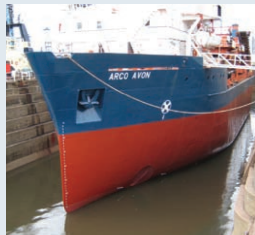
Low drag hull paint